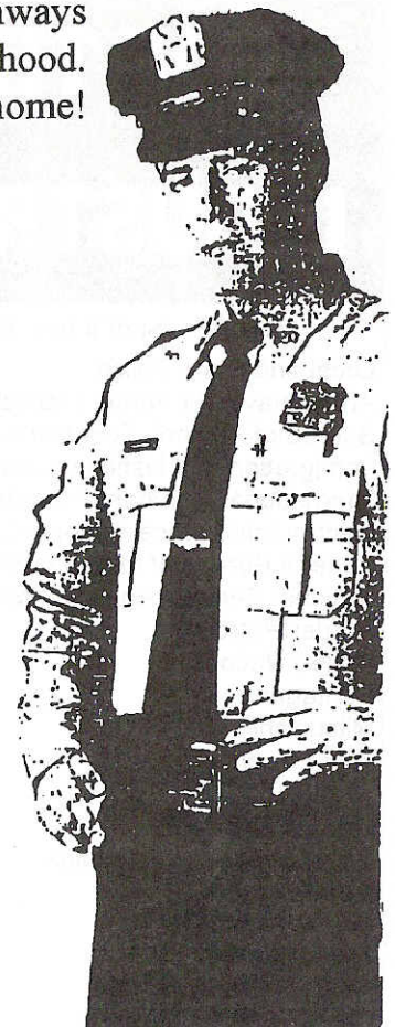
TYPICAL GANG MEMBER

Do Not Provoke Them! Do Not Let Them Corner You! Protect Yourself